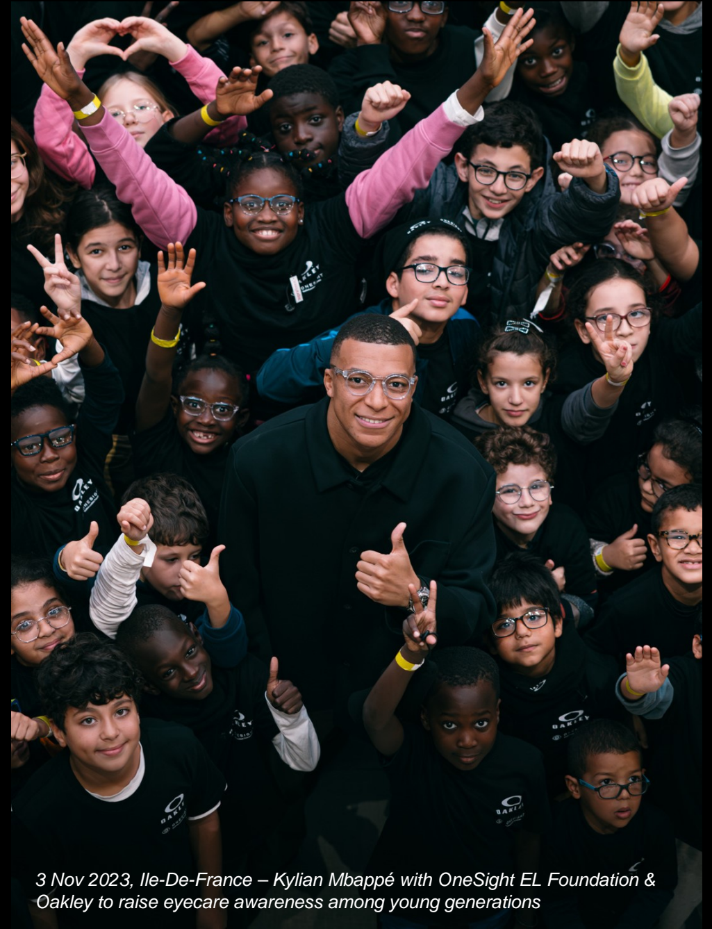
3 Nov 2023, Ile-De-France – Kylian Mbappé with OneSight EL Foundation & Oakley to raise eyecare awareness among young generations